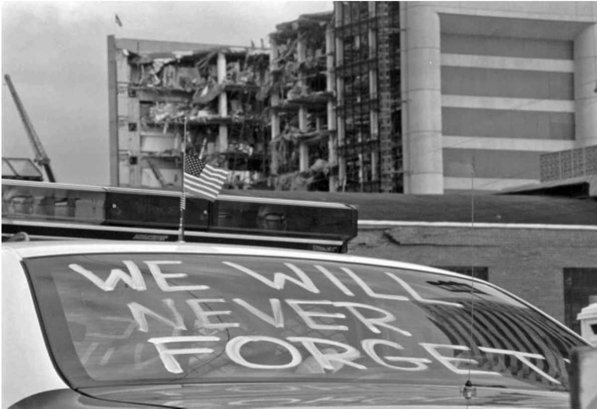
A police car decorated with the slogan “We Will Never Forget” sits before the wreckage of the Alfred P. Murrah Federal Building in Oklahoma City, April 1995.