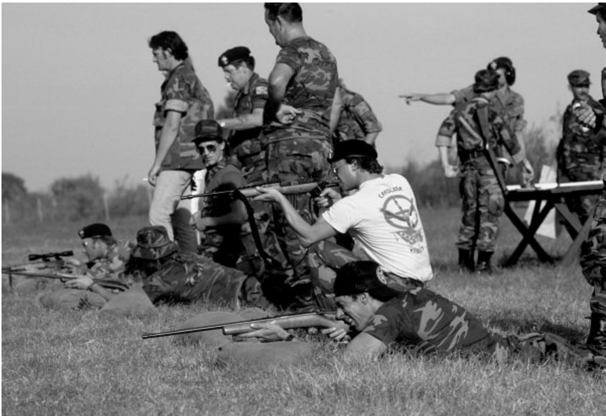
Paramilitary camp training, Carolina Knights of the Ku Klux Klan / White Patriot Party, 1985.